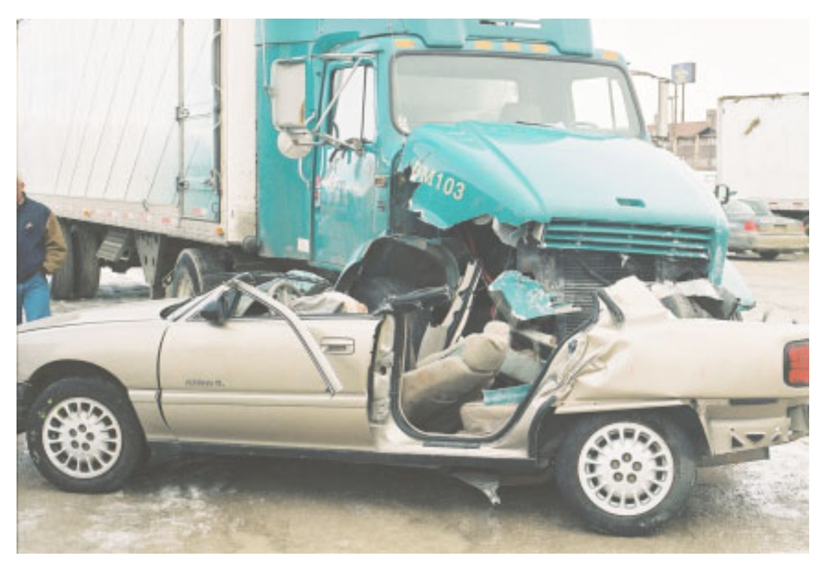
Figure 3. Vehicles aligned postcollision during accident reconstruction.