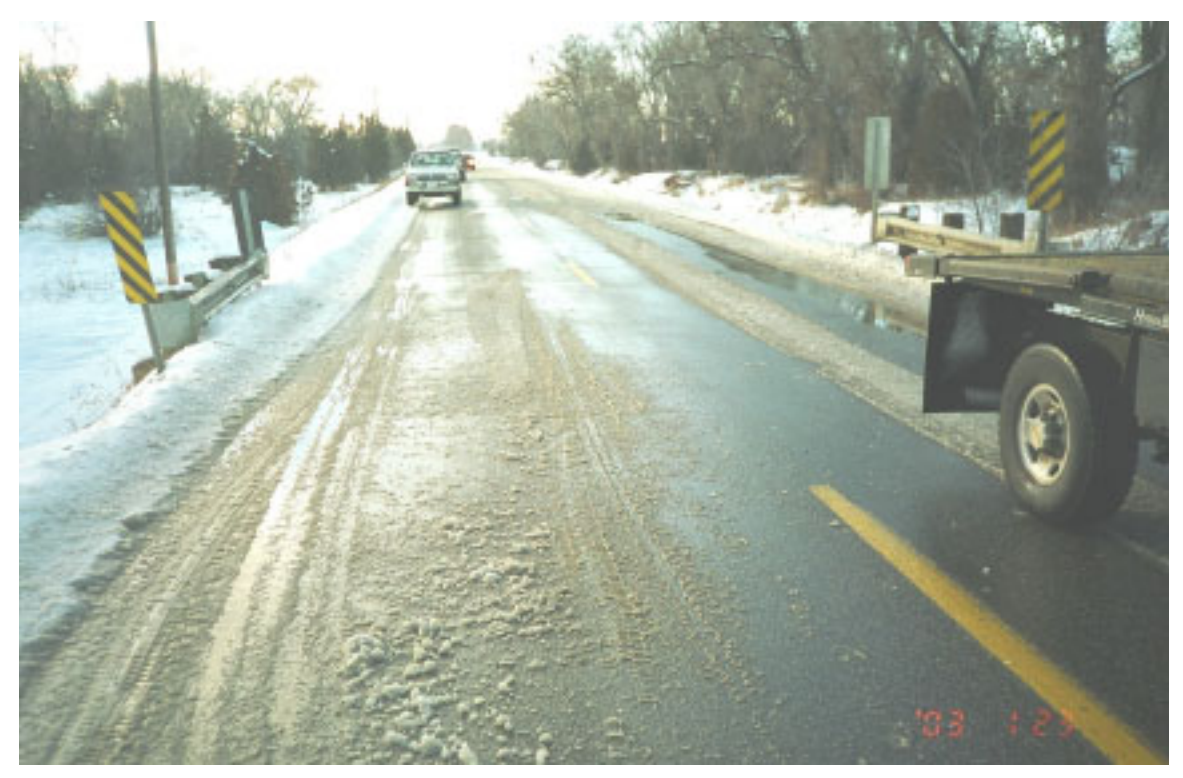
Figure 2. Roadway conditions at the accident scene.