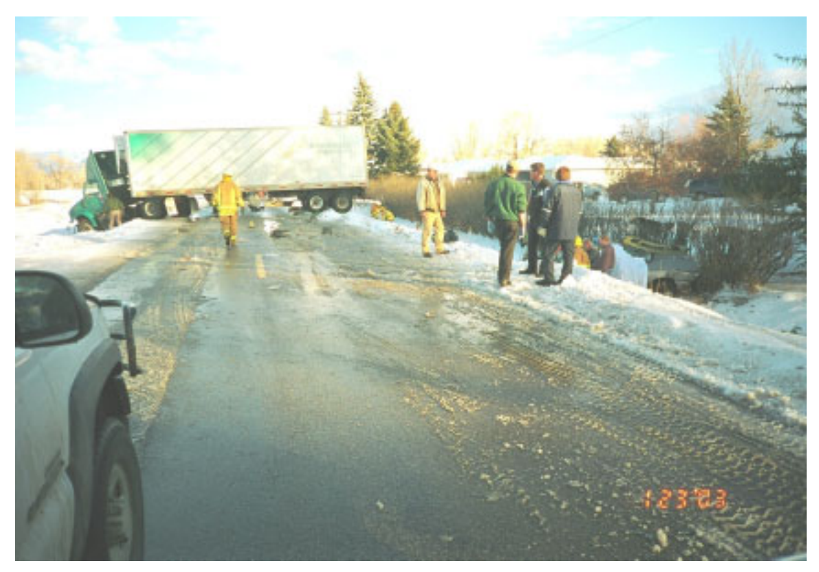
Figure 4. Vehicles at final rest.