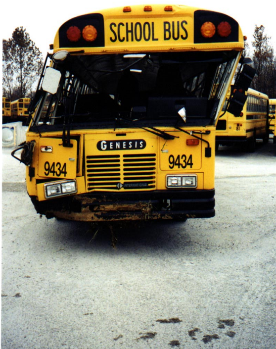
Figure 2. Postaccident front view of school bus.

The forward and rear emergency hatches installed along the roof centerline above seat rows 4 and 8, respectively, were missing (see figure 3); both hatches were found in the grass near the bus. The hatches were sheared off along the hinge line; the hatch openings remained intact.