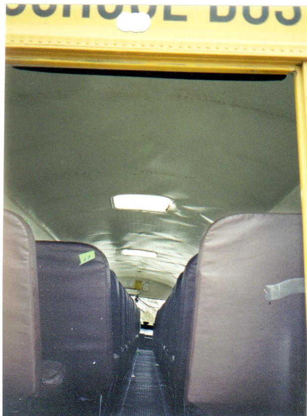
Figure 3. Postaccident interior view of roof, showing absence of emergency roof hatches.