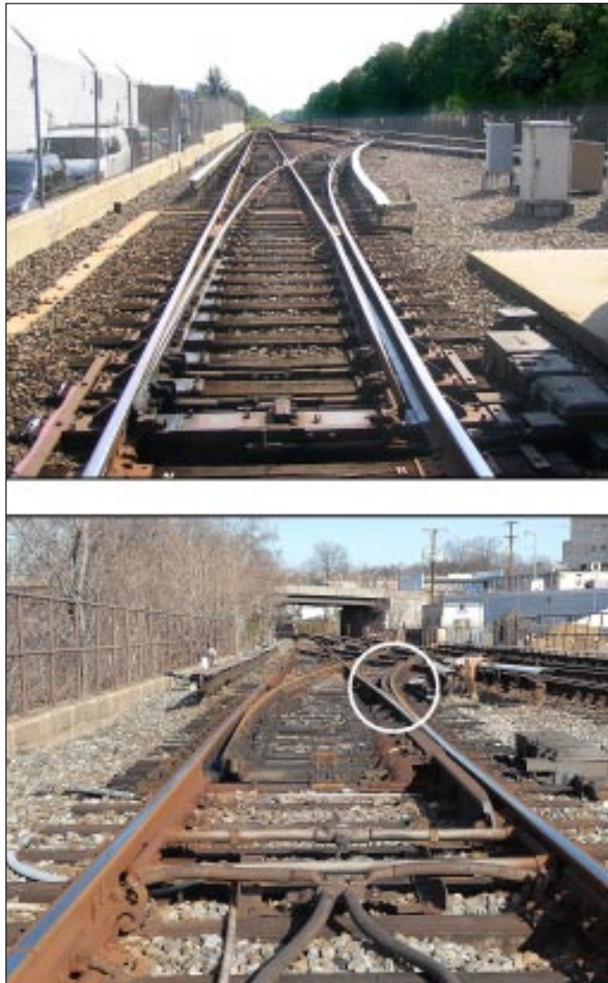
Figure 3. Unguarded No. 8 turnout (top) and guarded No. 8 turnout (bottom).

The derailment occurred as northbound train 504 entered the standard right-hand No. 8 turnout 6 on main track 2 traveling about 18 mph. (A standard turnout differs from a guarded turnout because it lacks guard rails positioned along the switch's running switch point and running rail on the turnout side. WMATA maintains both guarded and unguarded, or standard, turnouts. See figure 3.) The train derailed three of the four axles of its fifth car at chain marker E2 23+24, which is located along the curved closure