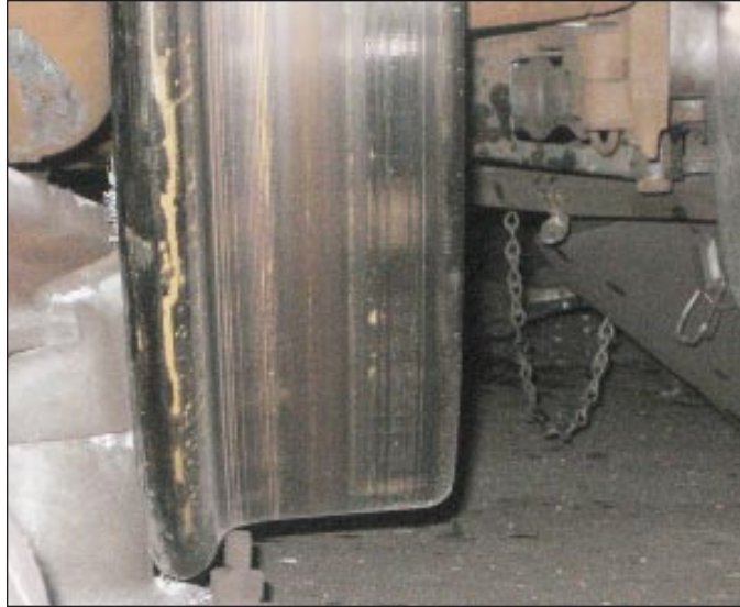
Figure 6. Wheel #2 from car 5152 with fish scale pattern from recent milling.

Investigators also examined the milling machine used to mill the wheels on car 5152. The alignment of the cutting head on the right side was about 1/16 inch closer to the inside than required. Further examination of the milling machine found worn parts.