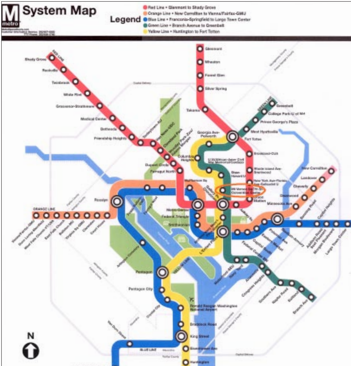
Figure 1. WMATA Metrorail system map.

Train 504 departed the Branch Avenue station at 3:15 p.m. instead of 3:06 p.m. as scheduled because trains were using only one track, or single tracking, 3 at the Mt. Vernon Square station. When it reached the L'Enfant Plaza station, train 504 was held to let two southbound trains pass through the single-tracking 4