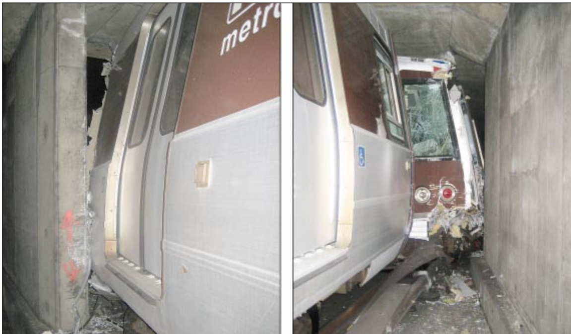
Figure 2. Front (left) and side (right) views of car 5152 where it struck tunnel wall.

According to data from the event recorder, the train accelerated to 45 mph. As the train approached the crossover from track 2 to track 1 at Mt. Vernon Square, the operator slowed the train. When the lead car reached the station platform, the train stopped. (See figure 2.) The train operator heard someone on the platform 5 yelling that there was a derailment.