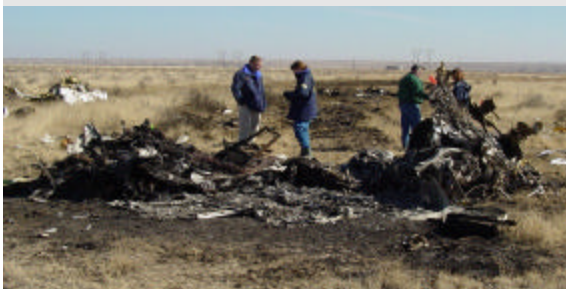
Investigators at the scene of the Cessna Citation 560 business jet crash outside of Pueblo, CO.