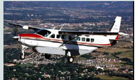
A Cessna 208 "Caravan", which is the subject of four new recommendations.

To read the recommendation letter, which includes the four recommendations, background information and photographs, visit the NTSB website at: http://www.nts.gov/Recs/letters/2004/A04_64_67.pdf