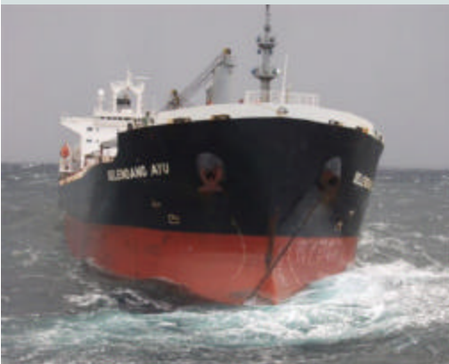
The Selendang Ayu anchored near Unalaska Island prior to breaking up.

The National Transportation Safety Board Office of Marine Safety launched a team of investigators to Unalaska Island, Alaska on December 9th to the grounding of a 738-foot bulk freighter. The Malaysian flagged motor vessel Selendang Ayu was carrying a cargo of soybeans from Washington State to China when, on December 6th, it began experiencing engine trouble. The ship later grounded, and then broke up in 15-foot seas and 30 knot winds. During the evacuation of the ship's crew, a U.S. Coast Guard HH-60 "Jayhawk" helicopter from Air Station Kodiak crashed in the water near Skan Bay on the north shore of Unalaska Island. Three Coast Guard helicopter crewmen and one crew from the freighter were rescued, but six freighter crew remain missing.