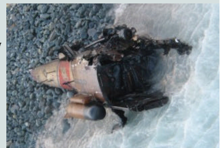
The wreckage of an HH-60 Jayhawk helicopter in Alaska.