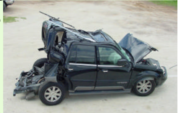
One of the vehicles that was involved in a fatal accident in Sulphur Springs, Texas.

On June 14th, the Office of Highway Safety launched a team to investigate an accident in Sulphur Springs, TX that killed five people. The accident, involving three tractor-trailers and two SUVs, occurred on Interstate-30 an hour and a half after a section of the highway had been closed due to another accident that killed three. Traffic had been diverted onto a parallel service road beginning at an exit about three miles prior to the original accident site and eventually congested both the service road and I-30. A 1991 Kenworth tractor-trailer rear-ended a stopped Hyundai Santa Fe SUV, fatally injuring all four occupants and the truck driver. These vehicles subsequently impacted another stopped tractor-trailer, then a Lincoln Navigator, and finally another tractor-trailer.