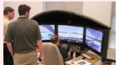
Participants in the SAE Event Data Recorder Conference test a state-of-the-art driving simulator