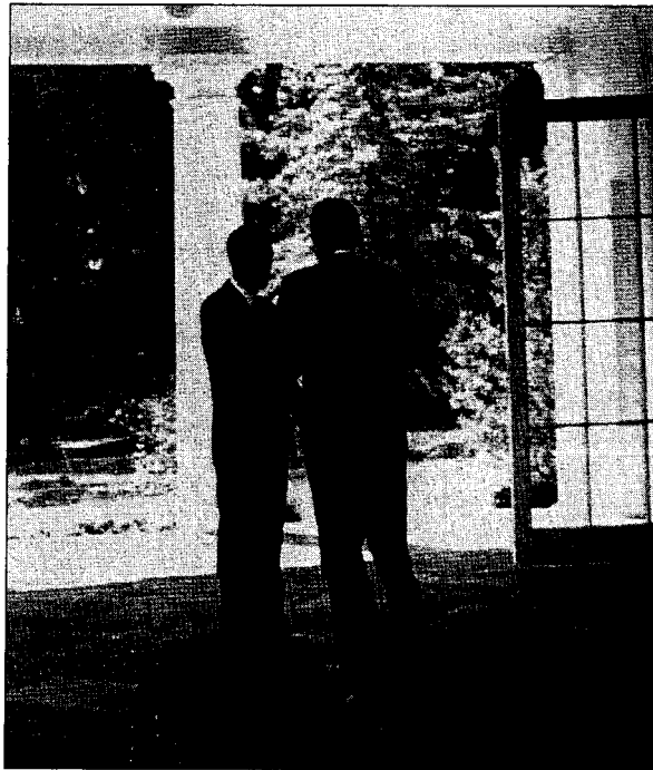
President Kennedy with Robert Kennedy, his brother, close advisor and Attorney General.

At this same time, however, Kennedy was increasingly preoccupied with political and military problems stemming from the Cold War. In late March, Kennedy had seriously considered sending a large contingent of troops to contend with an unstable political-military situation in Laos. On April 12, 1961, Soviet cosmonaut Yuri Gagarin became the first human to orbit the Earth, a severe blow to U.S. prestige that came less than four