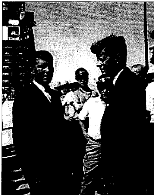
President John F. Kennedy is briefed by Astronaut Walter Schirra at Complex 14. The full MA-8 configuration that Schirra is scheduled to fly, a six-orbit mission, was displayed to the President, Vice President and National Aeronautics and Space Council.

the supposed "missile gap." For example, legendary aerospace pioneer Charles Stark "Doc" Draper had more than one dinner conversation before the 1960 election with both John and Robert Kennedy about the merits of rockets in which the Kennedy brothers expressed to Draper that they thought rockets to be a waste of money and were negative in general on this subject. 33 Journalist Hugh Sidey noted that on assuming the presidency, Kennedy "seemed to know less" and to be "less interested in" space than in virtually any other major policy issue. 34 Finally, if Kennedy had really been such a strong supporter of space exploration all along, why had he not