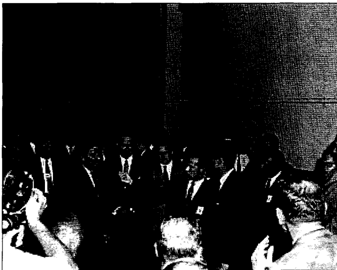
President Kennedy receives a briefing from Gordon Cooper during a tour of Cape Canaveral facilities.

At the top level of government, in February 1961 Kennedy had sent Khrushchev a telegram congratulating him on the Soviet launch of a robotic spacecraft to Venus. Khrushchev replied to this telegram and responded to the