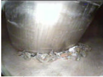
Figure 9 - CRDMP No. 78 Debris In Examination Area (As Found)

NRC BULLETIN 2002-01, "REACTOR PRESSURE VESSEL HEAD DEGRADATION AND REACTOR COOLANT PRESSURE BOUNDARY INTEGRITY"