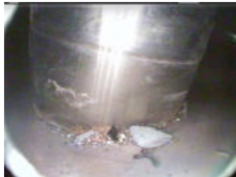
Figure 3 - CRDMP No. 33 Debris In Examination Area (As Found)