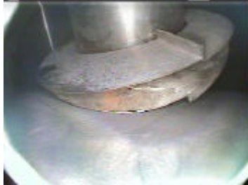
Figure 1 - CRDMP No. 58 Typical Insulation Support Ring Interference Before Repositioning

NRC BULLETIN 2002-01, "REACTOR PRESSURE VESSEL HEAD DEGRADATION AND REACTOR COOLANT PRESSURE BOUNDARY INTEGRITY"