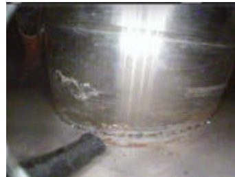
Figure 4 - CRDMP No. 33 Examination Area (After Debris Movement)