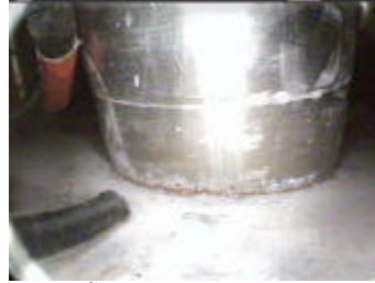
Figure 6 - CRDMP No. 14 Examination Area (After Debris Movement)