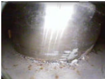
Figure 7 - CRDMP No. 37 Debris In Examination Area (As Found)