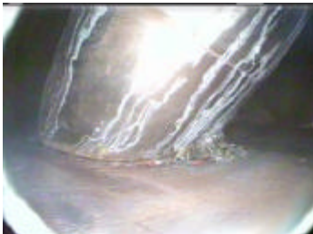
Figure 13 - CRDMP No.75 L-15 Conoseal Leakage Path at Penetration to RPV Head Interface Side View ( As Found )

NRC BULLETIN 2002-01, "REACTOR PRESSURE VESSEL HEAD DEGRADATION AND REACTOR COOLANT PRESSURE BOUNDARY INTEGRITY"