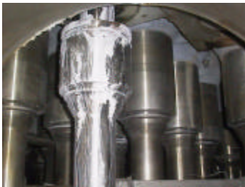
Figure 11 - CRDMP No. 75 L-15 Conoseal Leakage Path at CRDM Column (As Found)