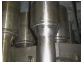
Figure 12 - CRDMP No. 75 L-15 Conoseal/CRDM Column (After Cleaning)