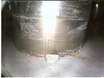
Figure 5 - CRDMP No. 14 Debris In Examination Area (As Found)

NRC BULLETIN 2002-01, "REACTOR PRESSURE VESSEL HEAD DEGRADATION AND REACTOR COOLANT PRESSURE BOUNDARY INTEGRITY"