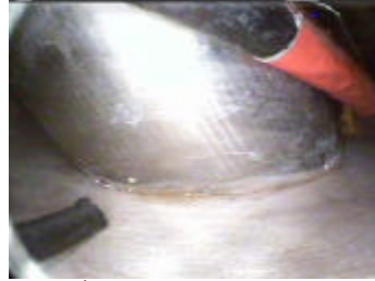
Figure 10 - CRDMP No. 78 Examination Area (After Debris Movement)