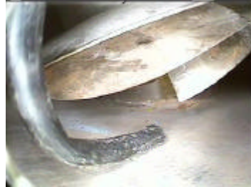
Figure 2 - CRDMP No. 58 Typical Insulation Support Ring Interference After Repositioning