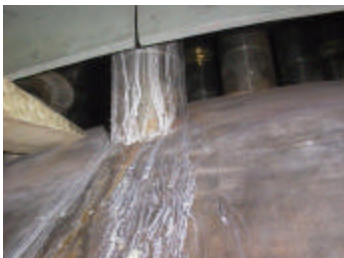
Figure 15 - CRDMP No. 75 L-15 Conoseal Leakage Path at Penetration to RPV Head Interface ( As Found )