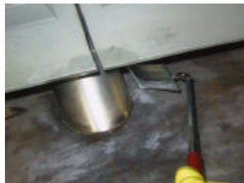
Figure 16 - CRDMP No. 75 L-15 Conoseal/CRDM Column at Penetration to RPV Head Interface ( After cleaning )