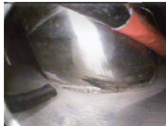
Figure 8 - CRDMP No. 37 Examination Area (After Debris Movement)