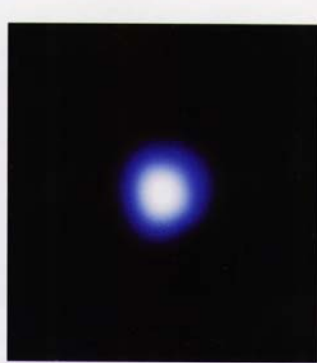
an 421, a quasar located 400 million lightyears from Earth, was taken with the High Resolution Camera on I July 2003.

The search for missing baryons is more than a bookkeeping exercise. "If you want to know how the Universe came to be as we see