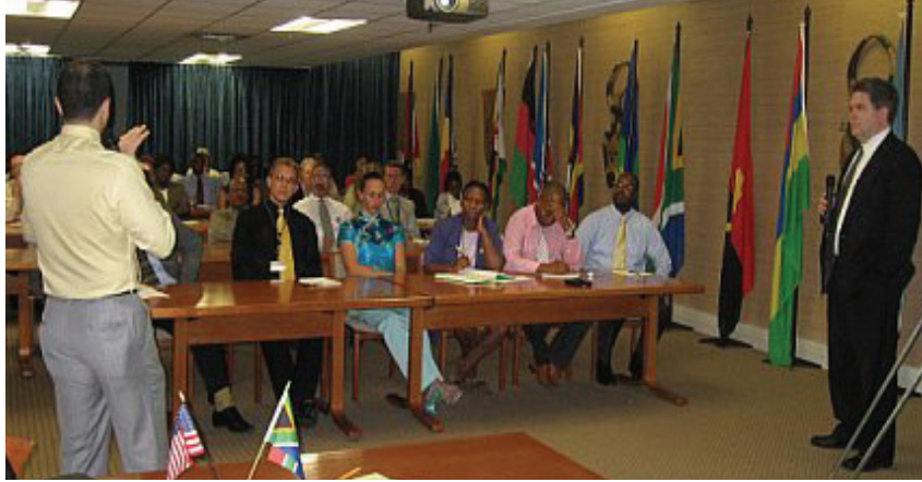
Figure 1 - Pretoria, South Africa, USAID Procurement and Grant Fraud Training.