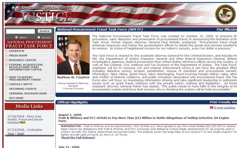
Figure 5 - National Procurement Fraud Task Force Website Homepage

To date, a principal accomplishment of the Information Sharing Committee has been to develop and maintain a website, http://www.usdoj.gov/criminal/npftf/ , devoted to providing the most up-to-date bulletins and facts about the status of procurement fraud cases and initiatives. The website contains the following key categories of information: