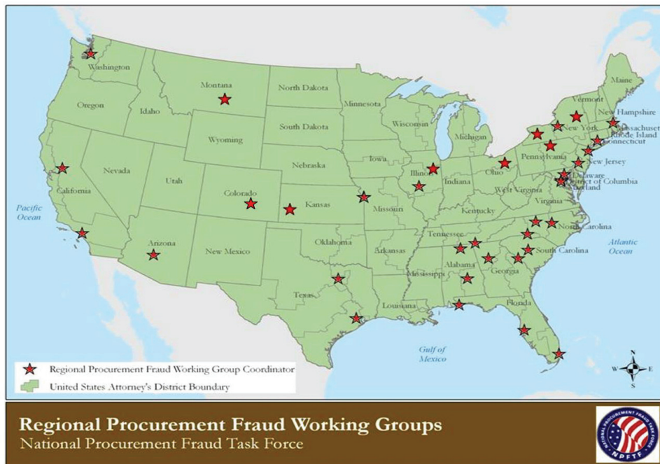
Figure 6 -Regional Procurement Fraud Coordinator Map

The Task Force also has formed numerous regional working groups to encourage the investigation and prosecution of procurement and grant fraud nationwide. To date, 36 U.S. Attorneys’ Offices are involved in the Task Force’s regional working groups. Contact information for the coordinators of these groups is listed on the Task Force website.