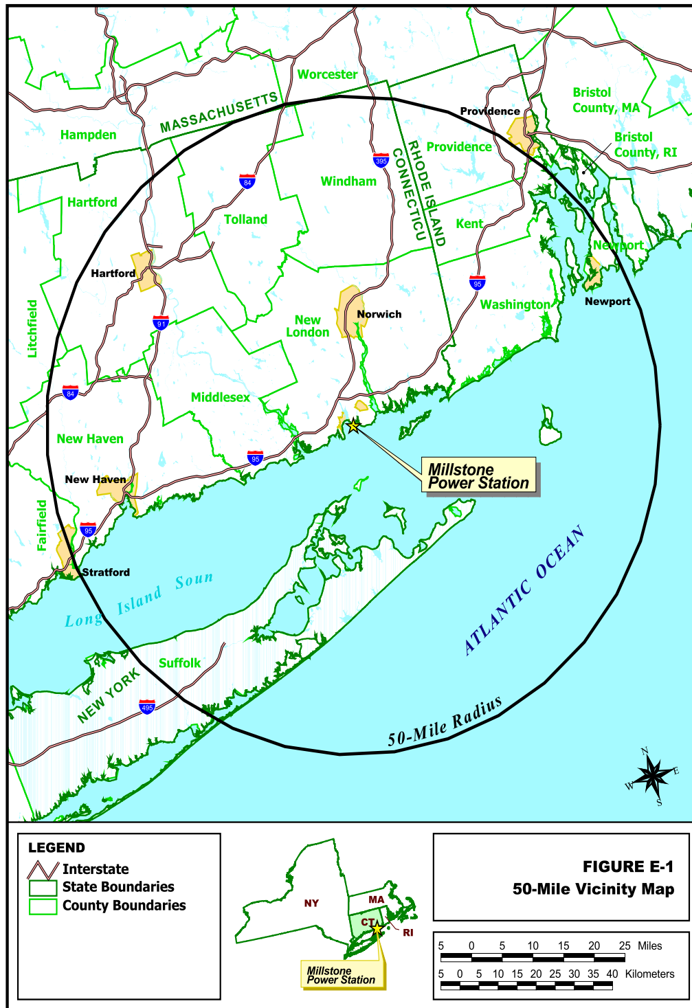
Figure E-1 50-Miles Vicinity Map