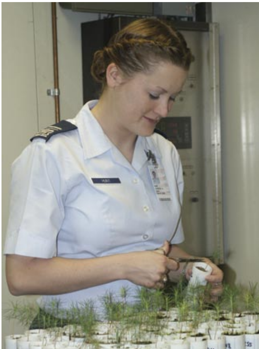
Cadet involved in hands-on research at the academy.

To assess student performance within our classroom-based programs, we use a series of standard end-of-semester assessments that include written, manuscript-style papers and short oral presentations suitable for undergraduate symposia. Rather than assigning grades based on achieving a specific outcome, we assess the students' ability