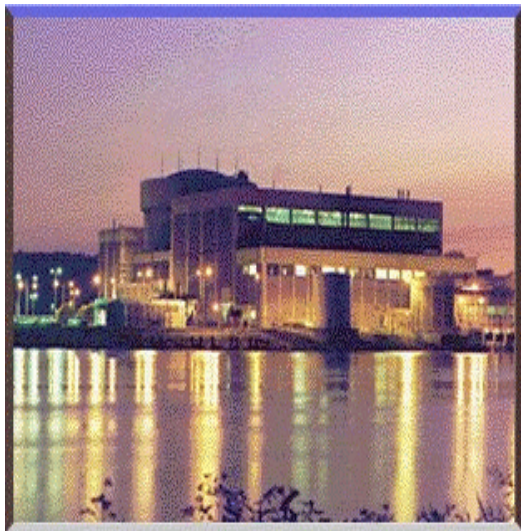
Fort Calhoun nuclear power plant

The NRC is responsible for developing, implementing, and enforcing rules and regulations that govern licensed, commercial nuclear power plants. Under the Atomic Energy Act and the Commission's regulations, licensees must allow NRC representatives to inspect the premises and facilities where nuclear material is used or stored. NRC conducts inspections at the Nation's 103 operating commercial nuclear power plants to ensure adequate protection of the public health and safety, the common defense and security, and the environment in the civilian use of nuclear materials.