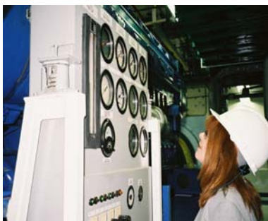
Inspector at work

IMC 1245 defines the training requirements for NRC inspectors. The objective of the program is to ensure that NRC staff have the knowledge and skills necessary to successfully implement the agency's inspection programs, including the baseline inspection program. According to guidance, inspectors must understand the facilities, equipment, processes and activities of the program, as well as the criteria, techniques, and mechanics of implementing the program.