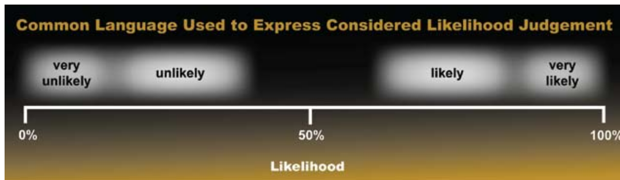
Figure P.1 Language in this Synthesis and Assessment Product used to express the team’s expert judgment of likelihood.