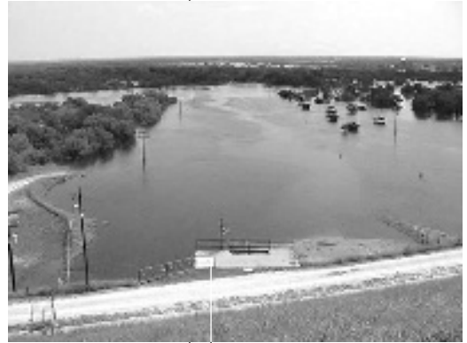
Choke Canyon Dam flooded area included picnic shelters in the State park.