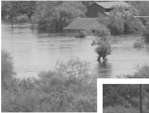
Flooding near Three Rivers, Texas, downstream of Choke Canyon Dam, September 11, 2002.