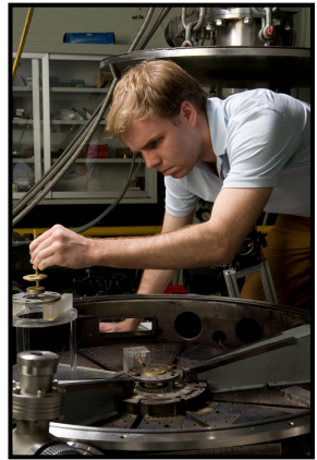
Cornell student preparing to load a wire array into COBRA

The National Nuclear Security Administration's Stewardship Science Academic Alliances (SSAA) program has an impressive record of achievement. The program supports top notch students and researchers who have produced many publications and received numerous awards and honors. Its key objective is to be a long-term recruiting pipeline to the national laboratories. This objective has been met with approximately 70 SSAA-supported students moving on to jobs at the labs since the program's inception in 2002.