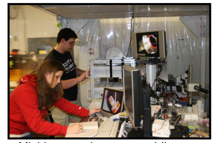
Michigan students assembling a target for laser experiments