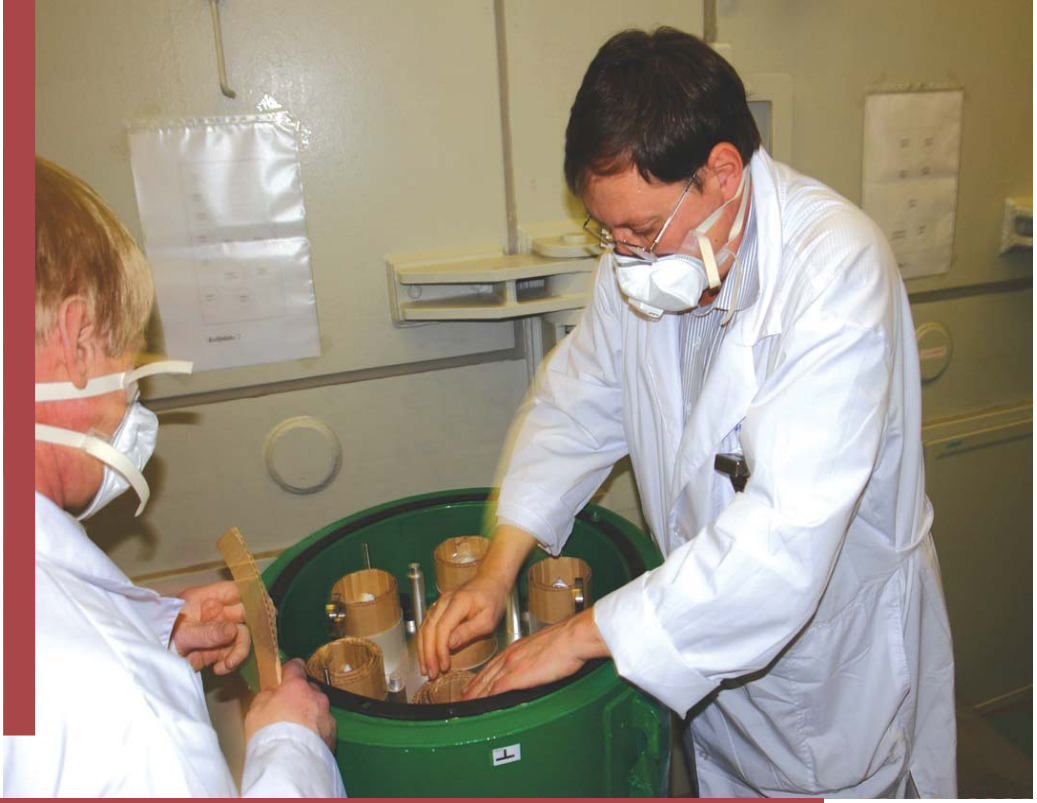
HEU RETURNED: In 2006, NNSA returned more than 590 pounds of highly enriched uranium from a former East German civilian nuclear facility to Russia in the largest shipment of Soviet-origin HEU ever conducted under GTRI.

Four shipments of spent fuel from Uzbekistan totaling 63 kilograms were shipped to Russia in 2006 and 80 kilograms of HEU spent fuel were shipped from the