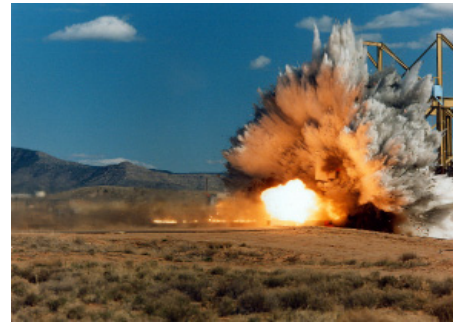
CRASH TEST: Among the more dramatic tests to be conducted at Sandia's rocket sled track facility is this crash of a complete F-4 Phantom into a massive reinforced concrete target to estimate the effect of a crash into a nuclear power plant containment building.