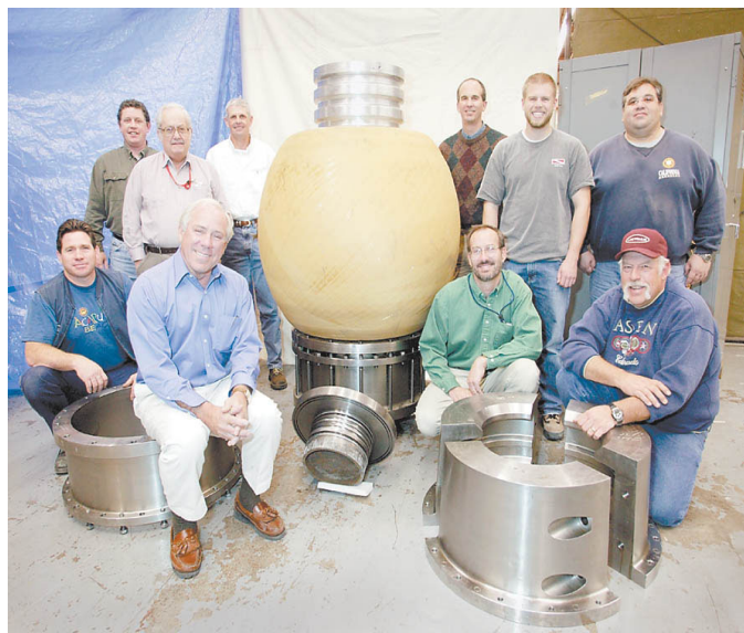
EXPLOSIVE EXPERIMENT CONTAINERS: Prototype containment vessel for explosive experiments.

The development of a full-size 2 meter vessel has been a joint project with Los Alamos National Laboratory (LANL), home to the state-of-the-art Dual Axis Radiographic Hydrotest Facility or DARHT. LANL may house the next generation Advanced Hydrotest Facility - experimental facilities likely to use the newly designed vessels.