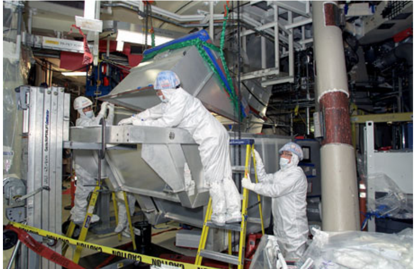
NIF: Workers install beampath onto a mirror frame under the target chamber.