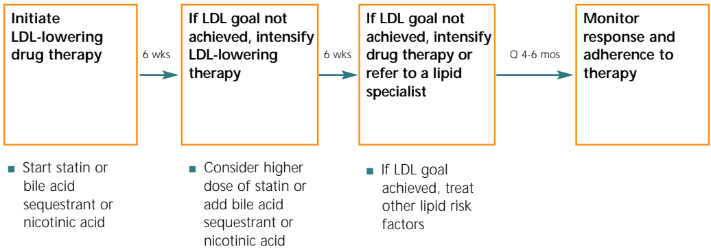
Figure 2. Progression of Drug Therapy in Primary Prevention

When drug therapy for primary prevention is a consideration, the third visit of dietary therapy (see Figure 1) will typically be the visit to initiate drug treatment. Even if drug treatment is started, TLC should be continued. As with TLC, the first priority of drug therapy is to achieve the goal for LDL cholesterol. For this reason, an LDL-lowering drug should be started. The usual drug will be a statin, but alternatives are a bile acid sequestrant or nicotinic acid. In most cases, the statin should be started at a moderate dose. In many patients, the LDL cholesterol goal will be achieved, and higher doses will not be necessary. The patient's response should be checked about 6 weeks after starting drug therapy. If the goal of therapy has been achieved, the current dose can be maintained. However, if the goal has not been achieved, LDL-lowering therapy can be intensified, either by increasing the dose of statin or by combining a statin with a bile acid sequestrant or nicotinic acid.