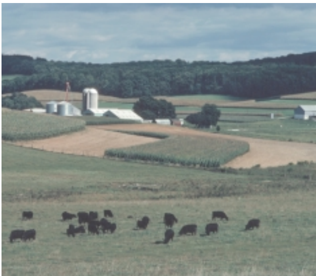
Conservation systems are designed to meet the needs of the land and landowners.