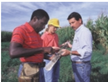
Above and right: Sound resource information and technology enable producers to make wise land use decisions.

NRCS identified two objectives to help landowners and land managers apply conservation systems to address the impacts of water shortages and flooding.