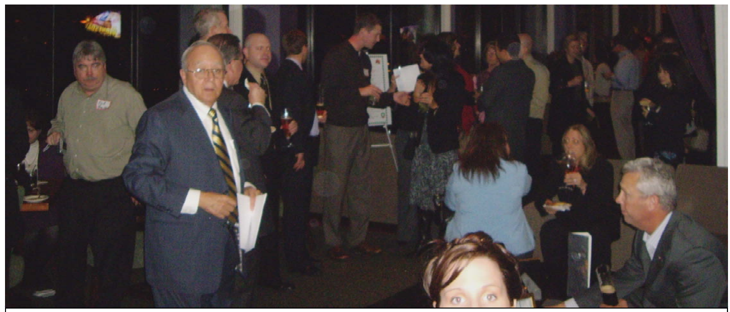
More attendees at the SBA holiday party at Clay's La Jolla, hosted by NAGGL.