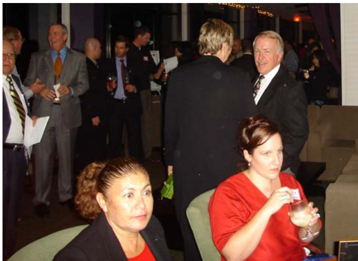
Candid photo of attendees at the SBA holiday party at Clay's La Jolla, hosted by NAGGL.