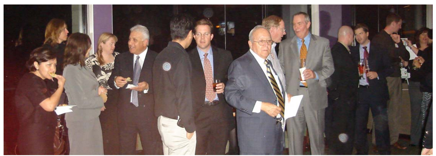
Another photo of attendees at the SBA holiday party at Clay's La Jolla, hosted by NAGGL.