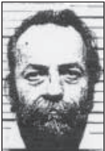
1987 (Age 49)