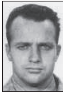
1965 (Age 26)