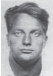
1965 (Age 26)