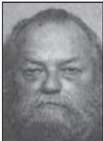
2002 (Age 64)