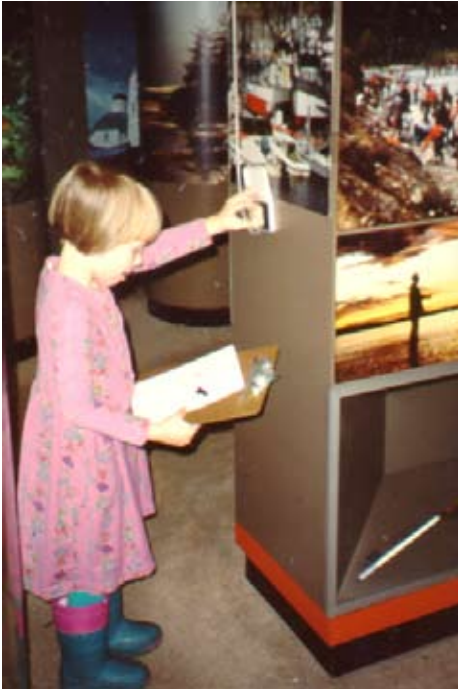
Stamping in the scavenger hunt.

The National Park Service provides protected habitat to a variety of species throughout the nation. National parks encourage visitors to experience a diversity of wildlife as part of larger ecosystems. In addition, national parks have played a prominent role in the recovery of bison, elk, trumpeter swans, and other species in trouble. In Alaska, rangers study populations of animals and their habitats to ensure that future generations are able to enjoy them as well.