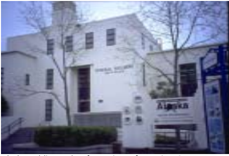
Alaska Public Lands Information Center in Downtown Anchorage