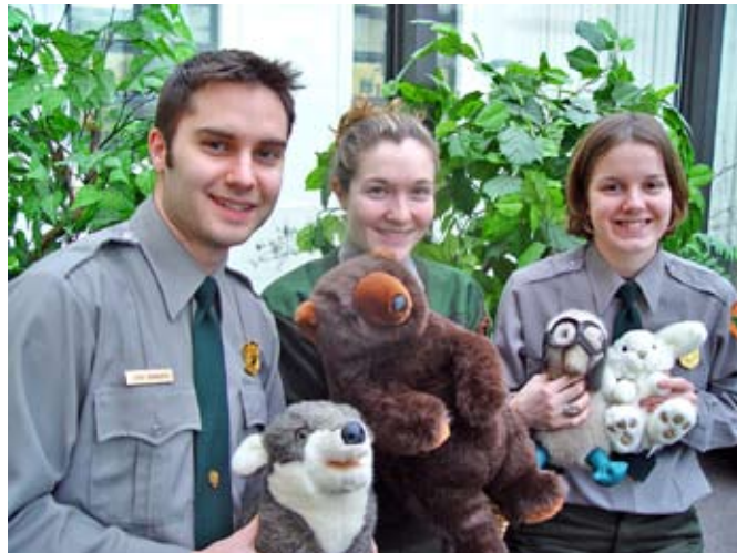
Puppeteers, classrooms, and puppets all enjoy the performance.

The National Park Service cares for the special places saved by the American people so that all may experience our heritage.