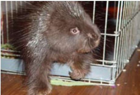
A porcupine visits a class in the auditorium at Alaska Public Lands Information Center.

There is NO charge for this program, but it is by appointment only. Please call in advance.