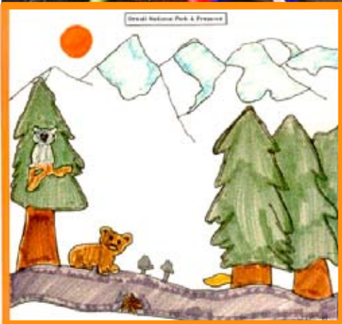
People and Parks: A place of fun and learning for all ages.

The Alaska Public Lands Information Center in Anchorage, managed by the National Park Service, will continue its emphasis on education in the urban community. Education staff will be in park uniform and will offer a venue of educational opportunities. In addition, teachers and youth leaders can look forward to accessing curriculum and web activities via the internet. 2004-2005 should prove to be another exciting year.