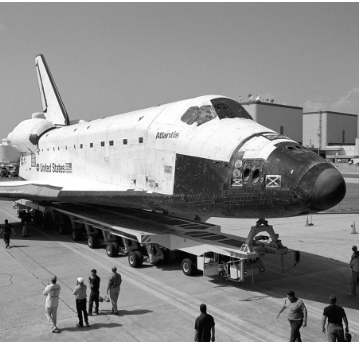
space shuttle program