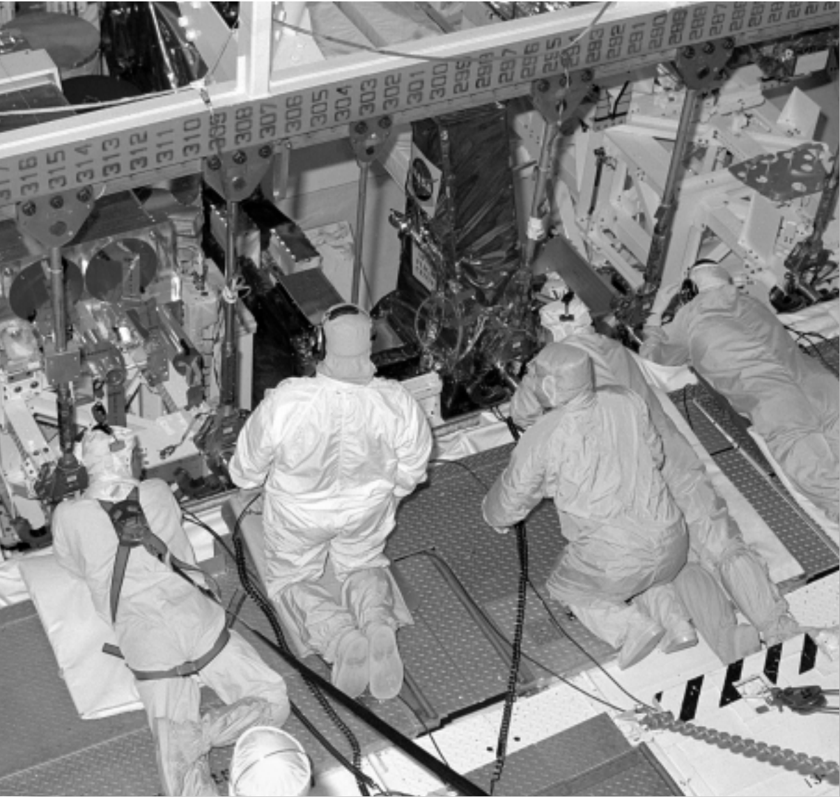
cross program areas