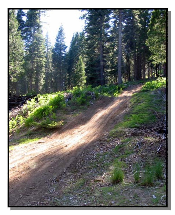
(Above) Some trails have been created by use. If there is no sign on the route showing it as a system route, it is closed. (Left) No Motor Vehicles route marker typically used to indicate a closure area.