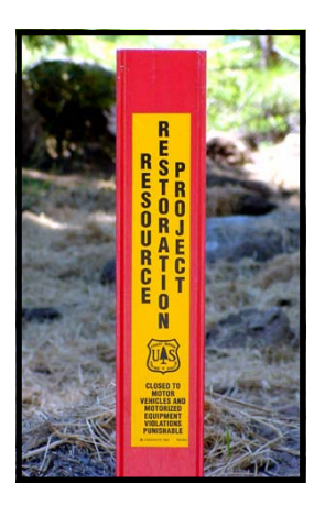
Restoration areas. (Above) An example of a completed restoration project. This treatment was implemented in the Lyons Creek area on the Pacific Ranger District. (Left) Restoration area sign.