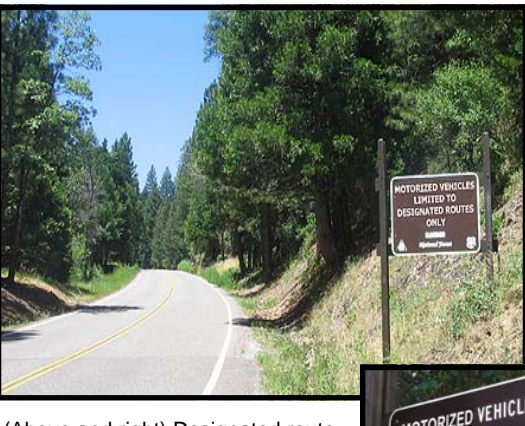
(Above and right) Designated route sign. (Below) System route marked with post and road number.