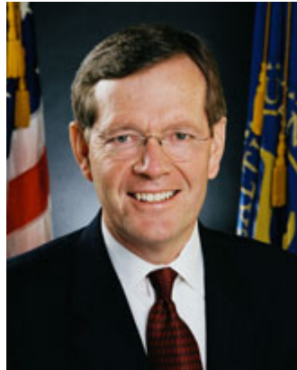
HHS Secretary Michael Leavitt