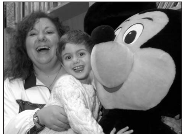
A child enrolled in a NIAMS study gives Mickey Mouse a big hug in the Children's Inn library.