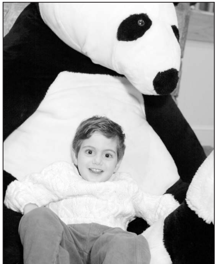
The giant stuffed panda in the foyer is one of the Children's Inn's main attractions.

The Children's Inn has made it easier for the Pediatric Rheumatology Clinic to focus on what they do best: studying diseases such as juvenile rheumatoid arthritis, lupus, scleroderma, dermatomyositis, familial fever syndromes, and other chronic diseases that affect children's joints, muscles, bones and skin. One exciting area of research involves learning how to treat children with biologic