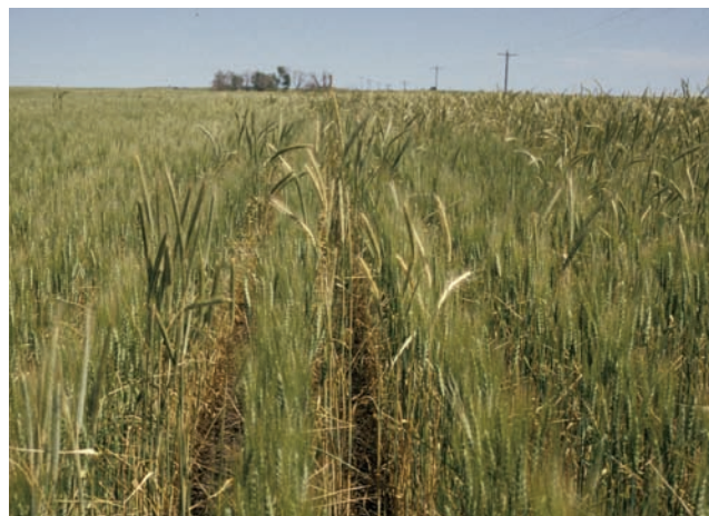
Figure 4. Feral rye is usually easy to locate in a winter wheat field after the boot stage because of its tall stature relative to most winter wheat varieties. The height differential between winter wheat and feral rye also provides an opportunity for selective chemical control with a ropewick application of glyphosate.

For small infestations prevent seed production by pulling or breaking off the plants at ground level shortly after heading. Once plants reach the soft dough stage in development, the seed becomes viable. Any roguing would need to be done before the plants reach this stage.