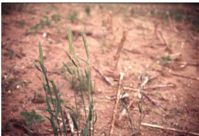
Figure 3. Feral rye is not always a tall, robust plant; under stressful conditions, such as those found in tilled and chemical fallow fields, grassy field edges and roadsides, rye plants can still grow and produce seed despite attaining heights of less than 10 inches.