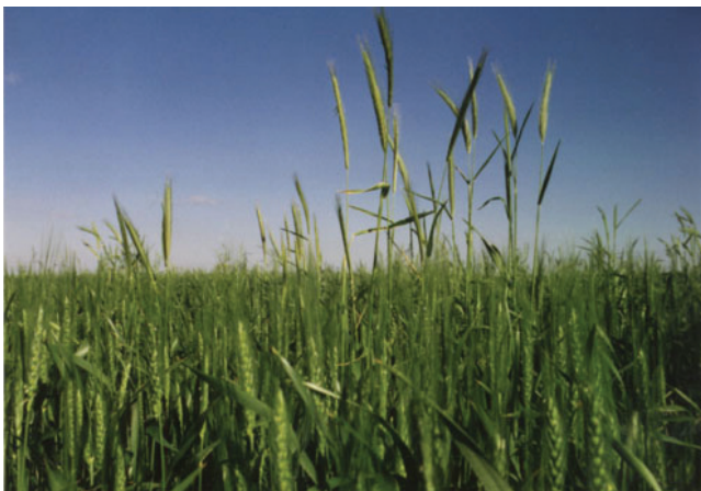
Figure 1. Feral rye is an increasing problem in the winter wheat-fallow production region of western Nebraska.

Research on the longevity of rye seed in the soil found less than 20 percent of feral rye seed still alive one year after deposition into the soil, with less than 5 percent viable after two years. However, farmer experience suggests that rye seed may lay dormant for five to 10 years or more. Rye seed has more seed dormancy and longevity than downy brome, but not as much as jointed goatgrass. Feral rye also may be introduced by planting contaminated seed or by not cleaning the combine between fields. Rye seed is also readily moved by water. Intense rainstorms (“gully washers”) are believed to move rye seed out of borrow ditches and infested fields into previously uninfested fields downstream.