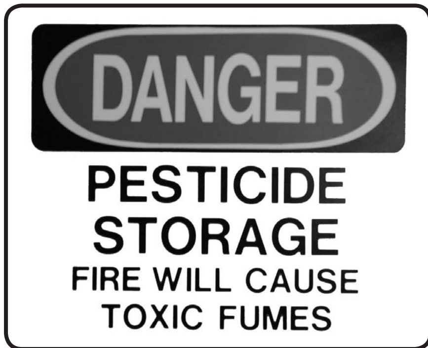
Danger! Pesticide storage sign.

Wooden pallets or metal shelves must be provided for storing granular and dry formulations packaged in sacks, fiber drums, boxes or other water permeable containers. If metal pesticide containers are stored for a prolonged period, they should be placed on pallets, rather than directly on the floor, to help reduce potential corrosion and leakage.