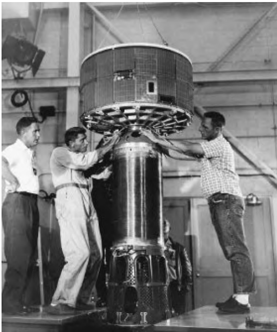
Workers putting the finishing touches on the nation’s first weather satellite, the Television Infrared Observation Satellite (TIROS), which launched from Cape Canaveral on 1 April 1960. The satellite weighed 270 pounds and carried two television cameras, a magnetic tape recorder, timer systems, transmitters, and a power supply. Early photographs provided new information on cloud systems, including spiral formations associated with large storms.