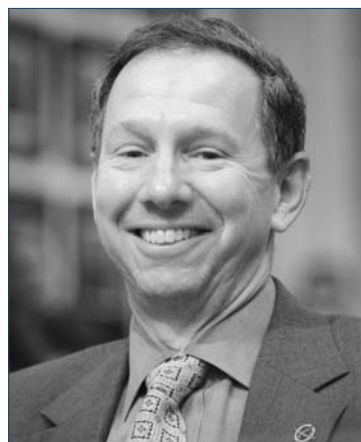
Michael Griffin, 11th Administrator of NASA, at his Senate confirmation hearing on 12 April 2005.

Michael D. Griffin was sworn in as the 11th Administrator of NASA on 14 April 2005. In a special address at NASA Headquarters, Griffin expressed his commitment to the President’s Vision for Space Exploration and to maintaining “vigorous programs in both robotic and human space exploration, as well as in Earth science and aeronautics.” His priorities also include: flying the Shuttle safely until its retirement in 2010; completing the International Space Station; encouraging partnerships with private industry; putting a new Crew Exploration Vehicle into service; and establishing a lunar return program. Griffin emphasized his confidence in the ability of NASA to maintain strong, well-balanced programs in science, exploration, and aeronautics within the context of the Vision for Space Exploration.