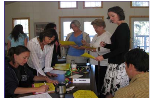
Directors Collaborate During Breakout Session