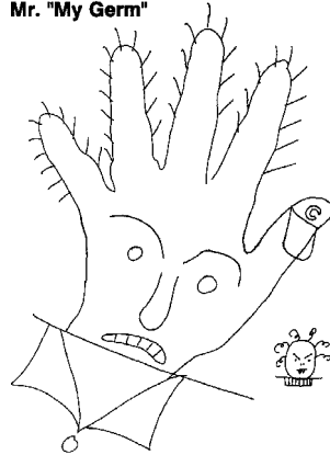
Mr. "My Germ"

print—and then adding eyes, nose, mouth and hair. You might get some that look like this.