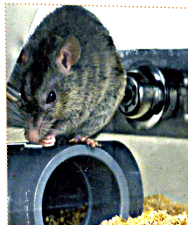
Jim Weed, NIH Division of Veterinary Resources

The most important thing is that the research must be relevant to human or animal health. Studies need to protect the animals’ welfare. That means that only the fewest number of the most appropriate species may be used. Under federal law, all animals must be treated humanely and undergo the least distress possible.