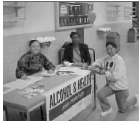
NASD staff prepare a screening site at Fort Benning, Georgia.

At the Medical University of South Carolina's Charleston Alcohol Research Center, screening organizers recruited research assistants from basic science labs to help in the clinic. The experience gave the scientists an opportunity to witness the clinical applications of their research.