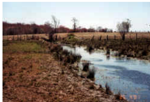
Stream before buffer