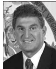
2007 States' Co-Chair Joe Manchin III, Governor of West Virginia