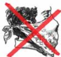
Handkerchief or Bandana

A dust mask or handkerchief will not protect you because mold can pass through it.