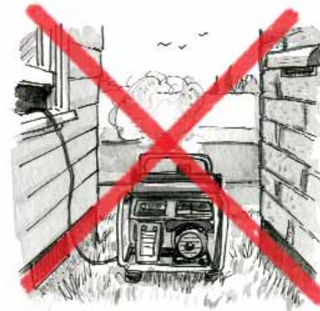
between buildings that are close together.