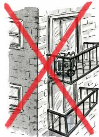
on a balcony.