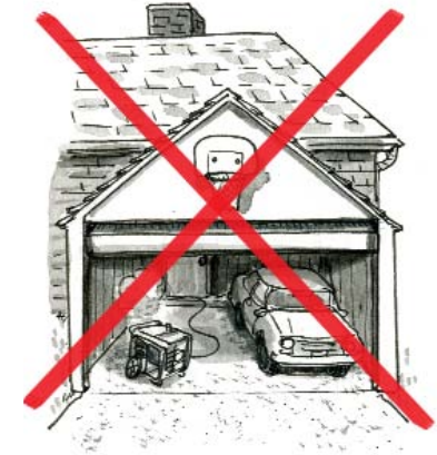
in a garage.