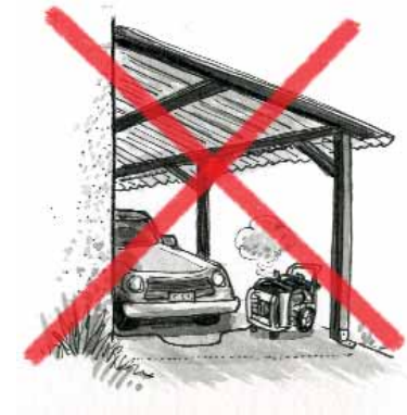
in a carport.