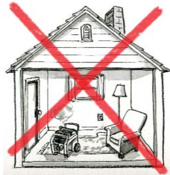
in your home.