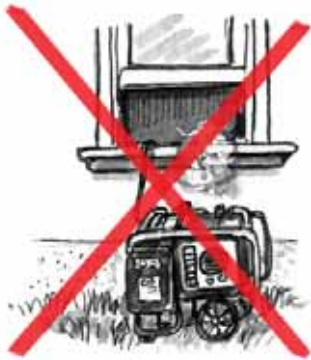
near a window.