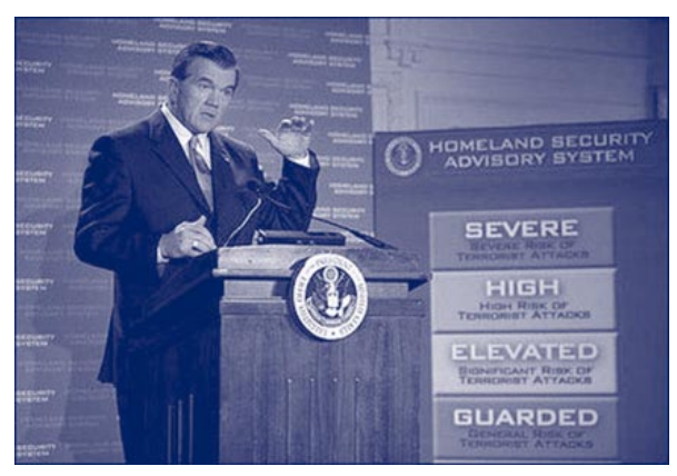
Tom Ridge, the President's Director for Homeland Security, discusses details of the new Homeland Security Advisory System.