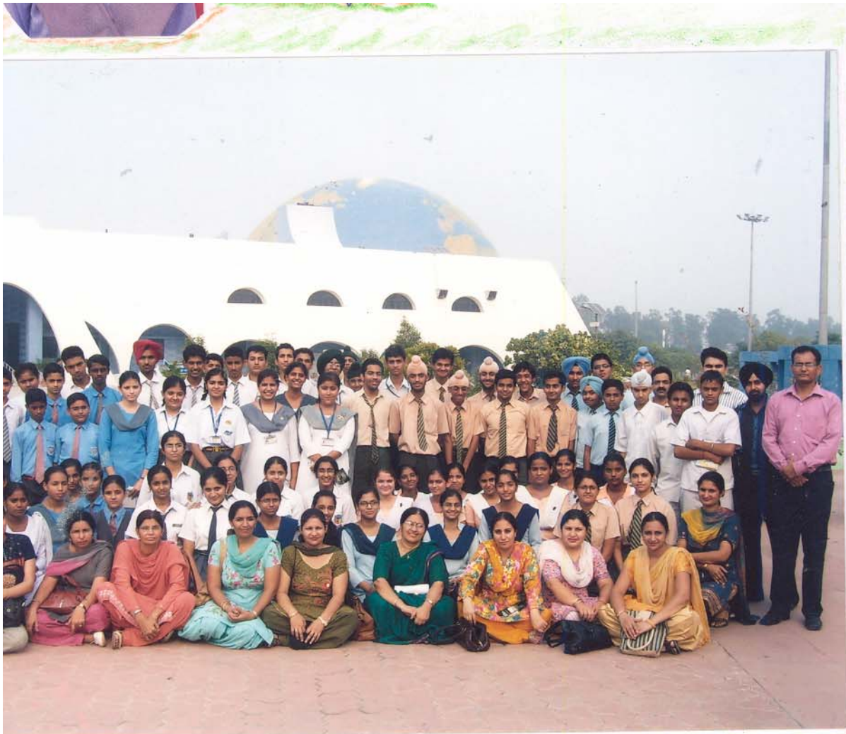
PUNJAB'S CLOUDSAT TEAM IN PUSHPA GUJRAL SCIENCE CITY ( Kapoorthalla )