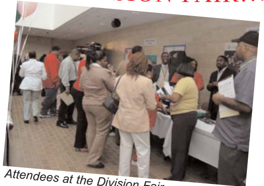
Attendees at the Division Fair