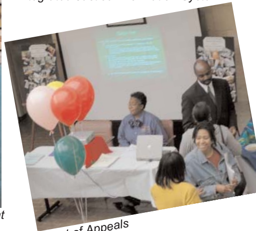
Court of Appeals