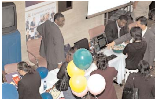
Integrated Justice Information System