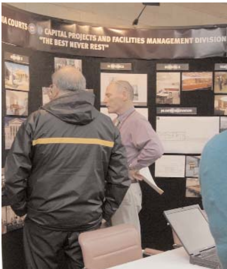
Capital Projects and Facilities Management Division Exhibit