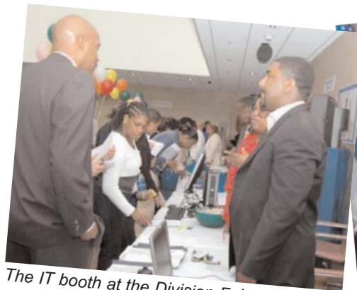
The IT booth at the Division Fair was, of course, Hi Tech!