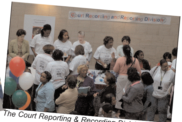
The Court Reporting & Recording Division