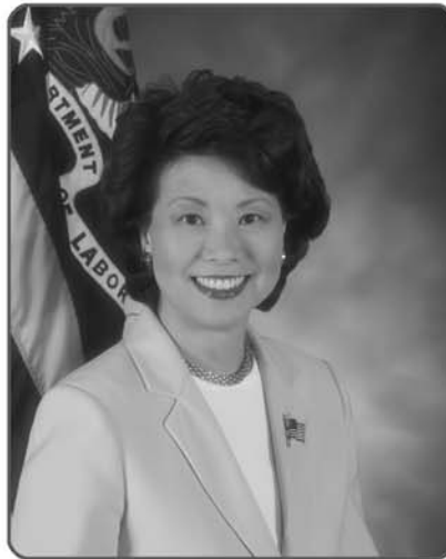
SECRETARY OF LABOR WASHINGTON

I am pleased to welcome you on the occasion of the 16 th Anniversary Observance of the Americans with Disability Act (ADA). Over the last sixteen years, the ADA has been the foundation for the tremendous growth in opportunities people with disabilities have seen in all aspects of employment and access to everyday life, and it will continue to positively influence the quality of life for people with disabilities for many years to come.