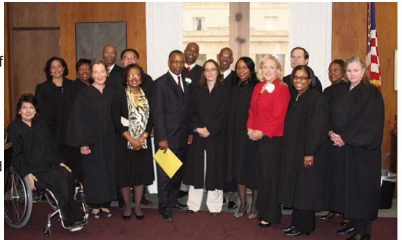
Family Court judges and CFSA Interim Director Roque Gerald pose with Senator Landrieu for a picture before the Adoption Day ceremony.