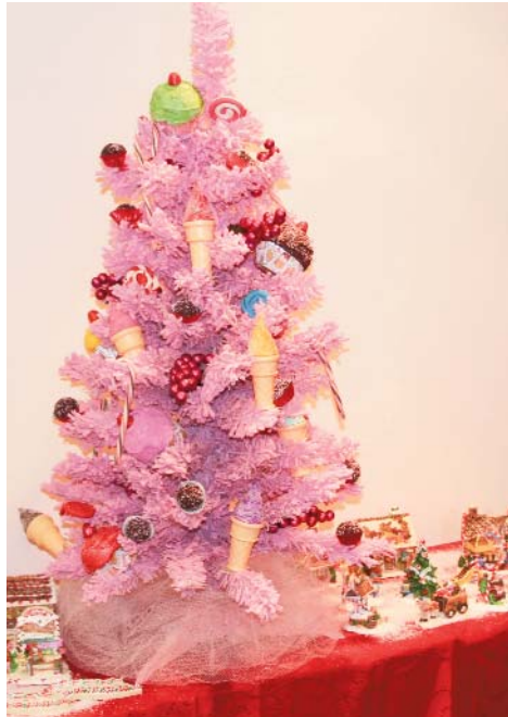
One of the yummy displays in the Executive Office this year.

many days there were before Christmas, so she brought it into the office. After the little Santa on top stared at her from her desktop she decided to put it up, writing 300 in pink chalk, in the space allowed. Fellow employees and visitors often laughed, commenting on how early this countdown board was up. However, as the days dwindled