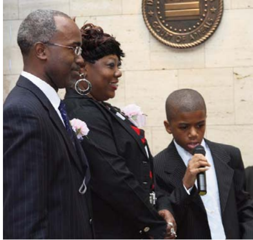
A proud family listens to the wise words of their son.

The weather and traffic concerns were no match for the joy that is adoption. The courthouse was packed full of smiling faces, warm hugs, and happy children. The cer-