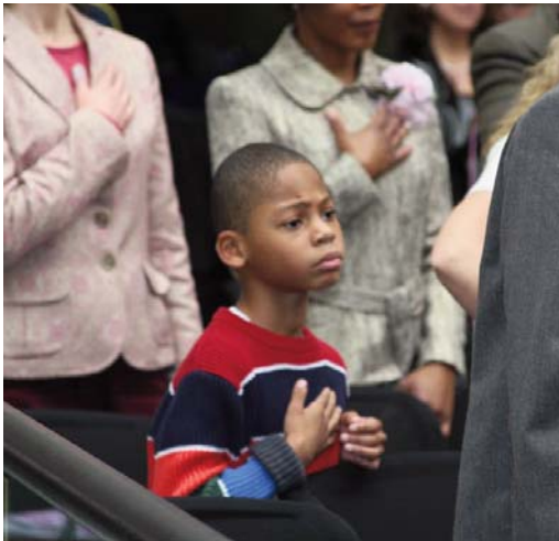
A young audience member watches the color guard presentation.

The event was a great success and the adoption day planning committee congratulates those whose lives will be enriched through adoption in 2009.