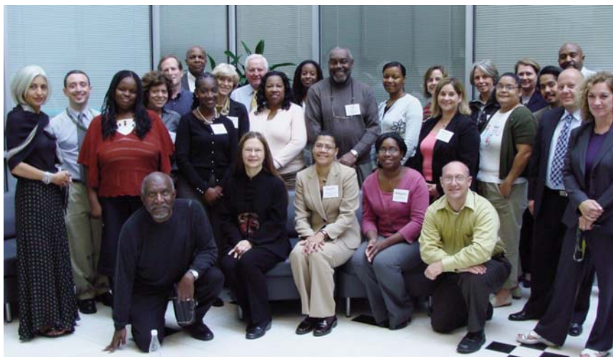
Staff and mediators who just completed the new training.

In October 2008, the Multi-Door Dispute Resolution Division ("Multi-Door") designed and implemented a new mediation training format. For the first time, basic mediation skills training was offered simultaneously to prospective mediators for the Civil, Small Claims, Family, Child Protection and Landlord/Tenant