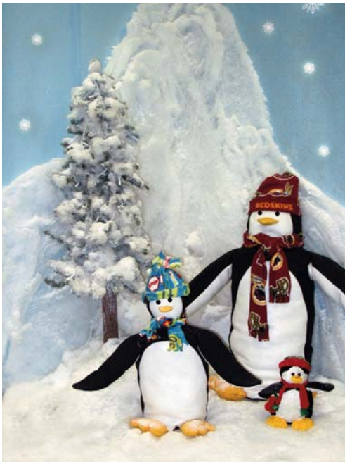
The famous skiing penguins.