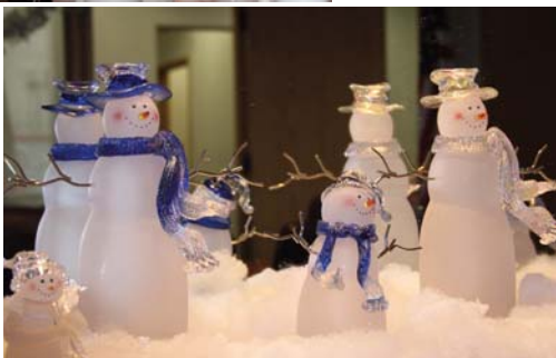
One of the many snow people displays at the 2008 holiday party.