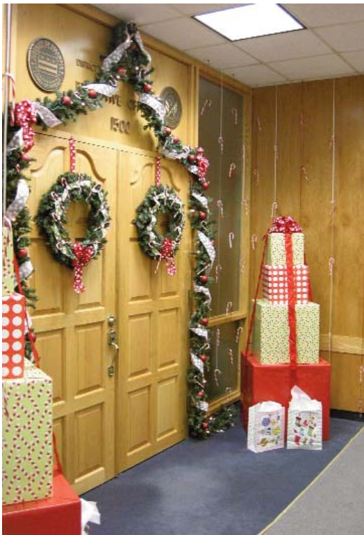
The Executive Office front door in 2001, one of the first displays.