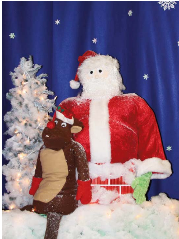
Part of the 2008 Executive Office front door display.