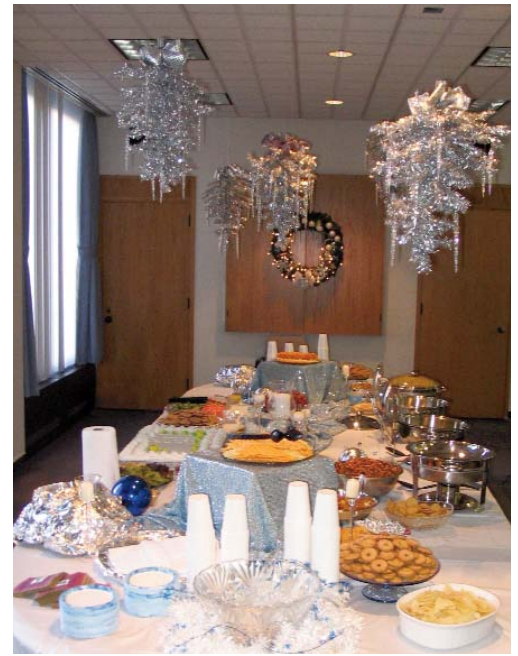
The table is ready for the 2005 Executive Office holiday party.