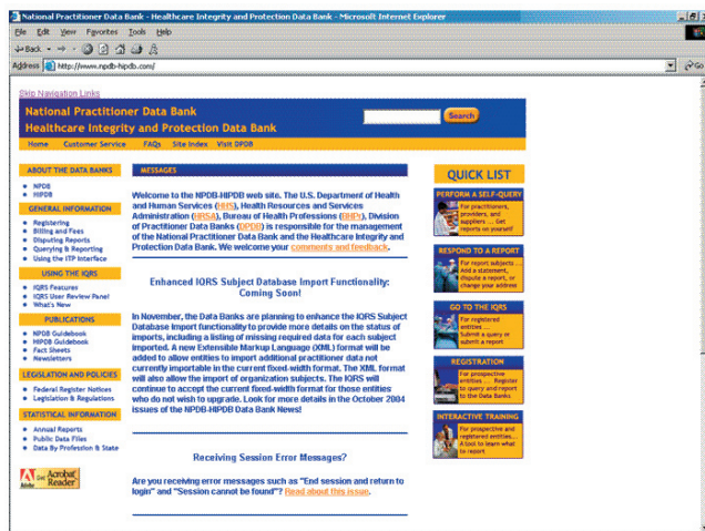
Figure 1. NPDB-HIPDB Home Page

For additional information, visit the NPDB-HIPDB Web site at www.npdb-hipdb.hrsa.gov . If you need assistance, contact the NPDB-HIPDB Customer Service Center by e-mail at help@npdb-hipdb.hrsa.gov or by phone at 1-800-767-6732 (TDD 703-802-9395). Information Specialists are available to speak with you weekdays from 8:30 a.m. to 6:00 p.m. (5:30 p.m. on Fridays) Eastern Time. The NPDB-HIPDB Customer Service Center is closed on all Federal holidays.