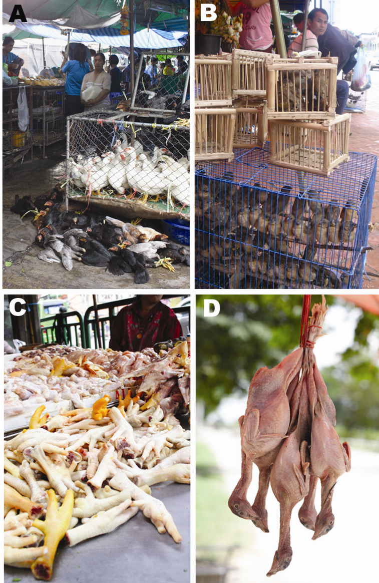
Figure 1. A) Poultry at live bird market; B) house sparrows at live bird market; C) chicken meat at food market; and D) moor hen meat at food market.