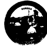
GRAY DAVIS Governor