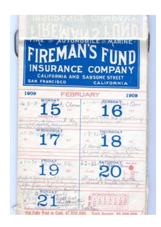
In the early days, the Whites recorded the weather on their calendar along with the daily egg count.

Amid all this upgrading, however, Gerald's observant eyes are still constantly searching the skies for the next change in the weather or the atmospheric phenomena that require NWS reports. Through the years, these phenomena included tornadoes, Blue Northers, dust storms that blocked the sun and left sand piled on windowsills, flooding rains, thunderstorms which sometimes dropped hail on precious crops, damaging winds, smoke, haze, aurora, snow and ice storms, halo phenomena and rainbows.